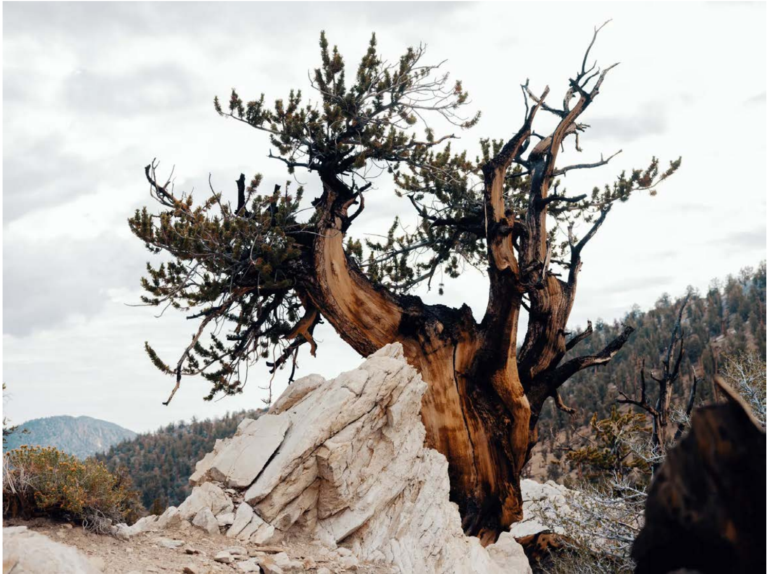
Great Basin bristlecone pines are known for their extraordinarily slow growth, expanding as little as one inch every 100 years.