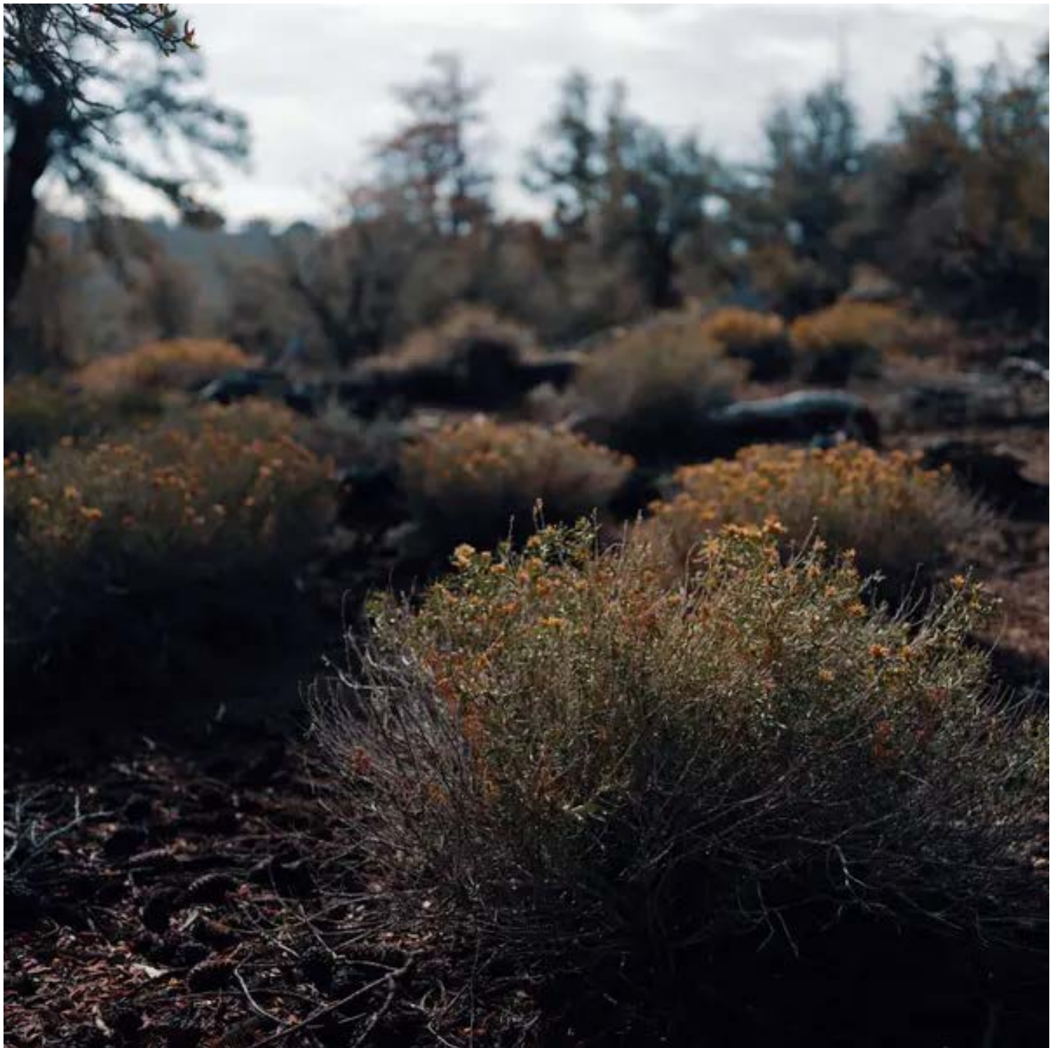
Great Basin bristlecone pine trees endure in harsh conditions that other vegetation cannot withstand.