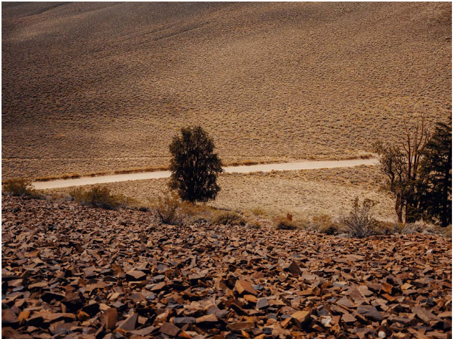
Great Basin bristlecone pines live only in California, Nevada and Utah.