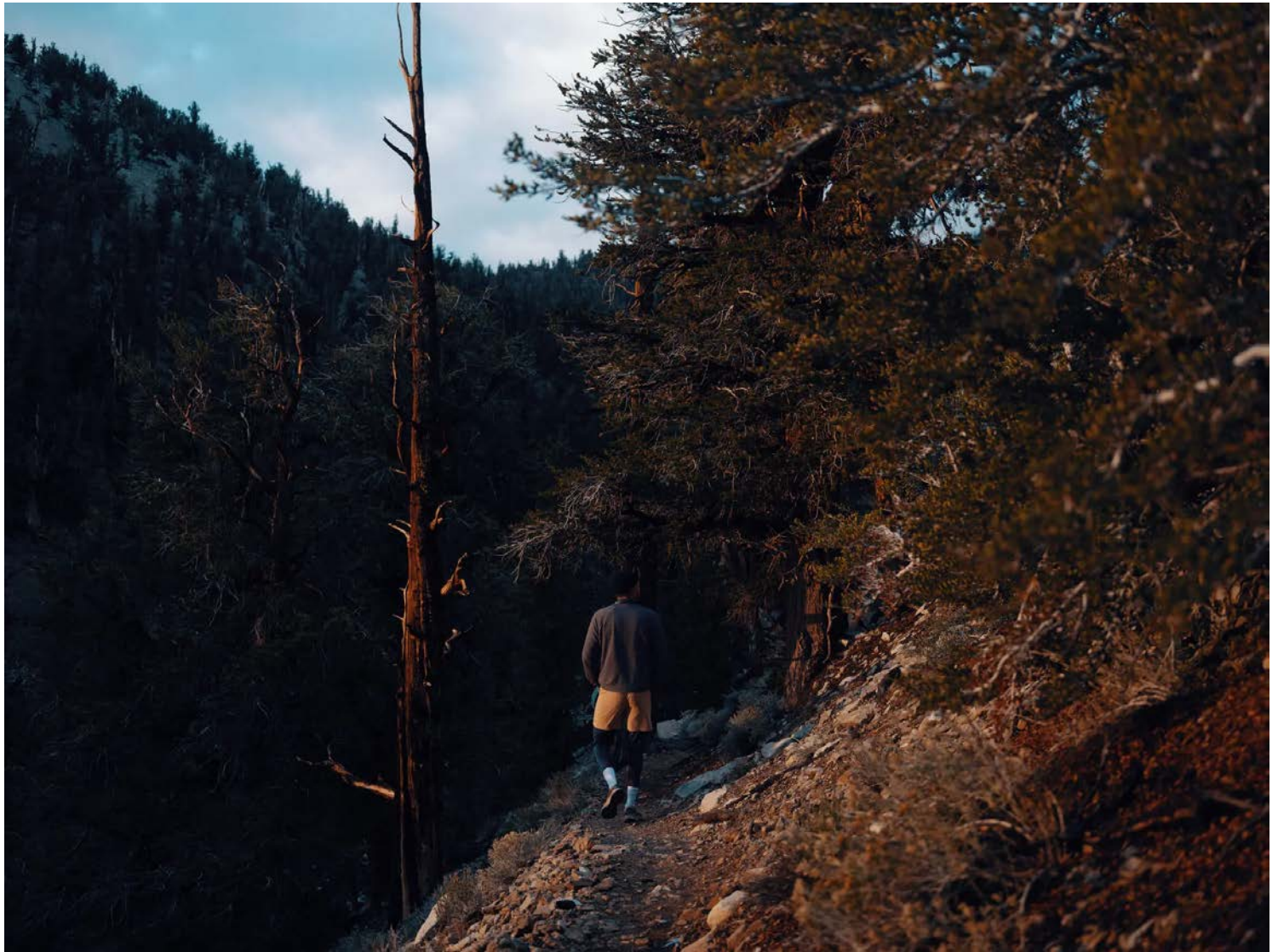
The trees have persisted through and witnessed so much that they are essentially living fossils.

The bristlecones have persisted through and witnessed so much that they are essentially living fossils. Studying these ancient trees' rings has allowed scientists to improve the accuracy of radiocarbon dating and to create records of the Earth's climate going back 11,000 years, essential for understanding the impacts of global warming.