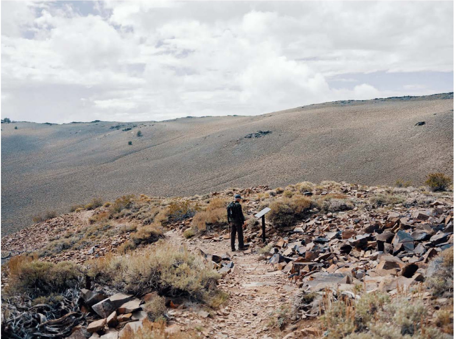
Deep in the Inyo National Forest, along a desolate path accessible only to hikers, the twisted trees cling to a rocky slope.