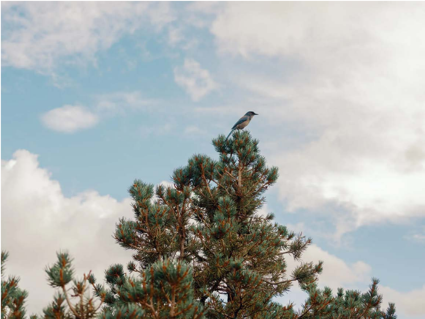
Bristlecone pines can live and reproduce even with only one branch of needles.

It’s not entirely clear why bristlecones live so long, but one key seems to be that the trees’ sluggish growth, expanding as little as one inch every 100 years, makes their wood especially dense and confers extra protection against bugs and rot. Also, the air in the Inyo National Forest is so dry, the climate so cold and the rocky dolomite soil — the color of which lends its name to the White Mountains — so unfriendly that the pines have little competition from other plants, creatures or pests. (Researchers in Chile recently revealed that they may have discovered an even older tree, though its age has yet to be officially verified.)