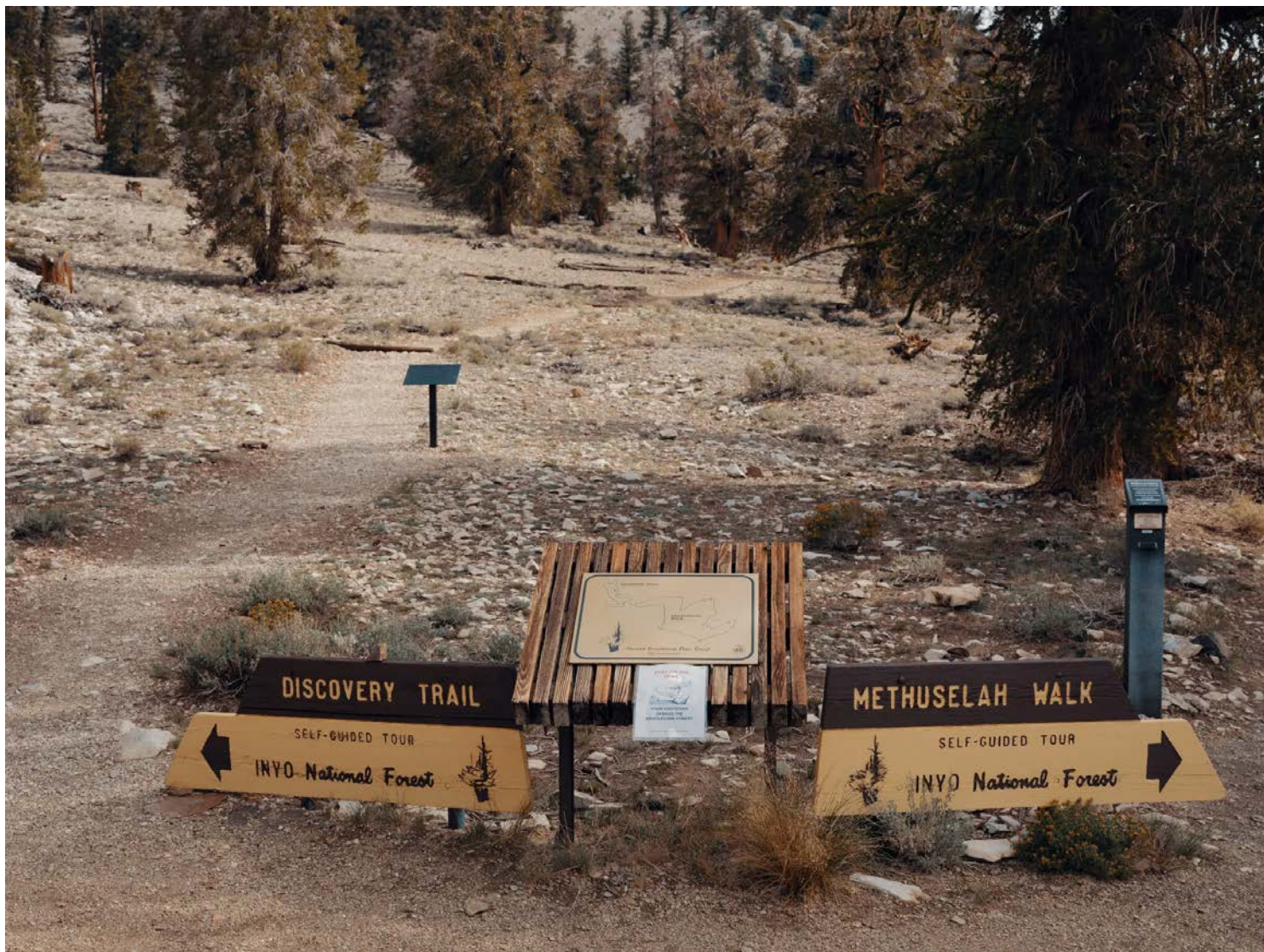
In the grove, the exact location of Methuselah, the oldest tree, is known only by a limited group of mostly forestry researchers and employees.