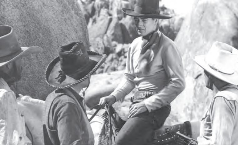
Photo from The Lawless Range courtesy of Beverly and Jim Rogers Museum of Western Film History