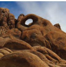
Eye of the Alabama