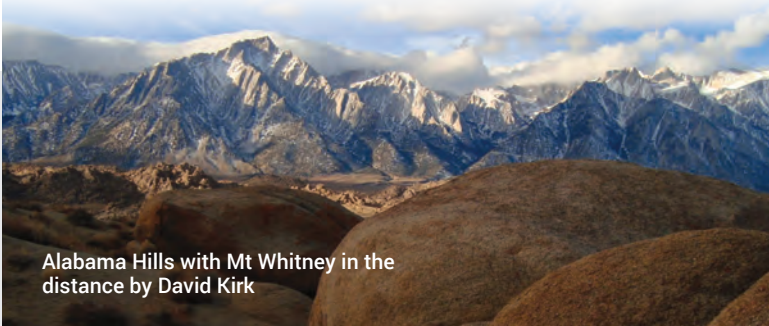
Alabama Hills with Mt Whitney in the distance