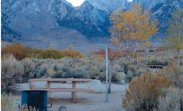
Tent site at Tuttle Creek Campground near sunset