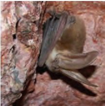
Townsend's big-eared bat